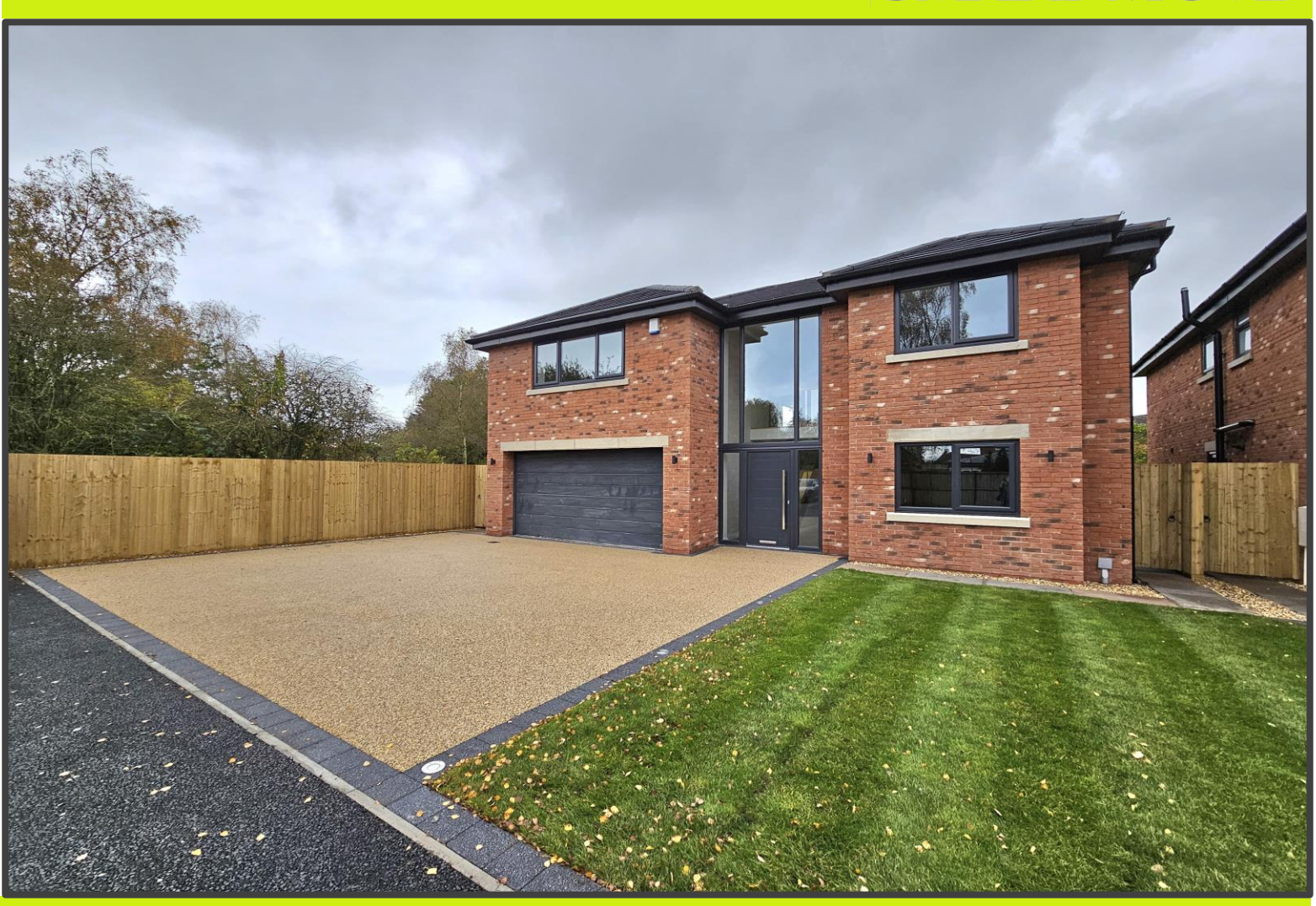
Asking Price £595,000